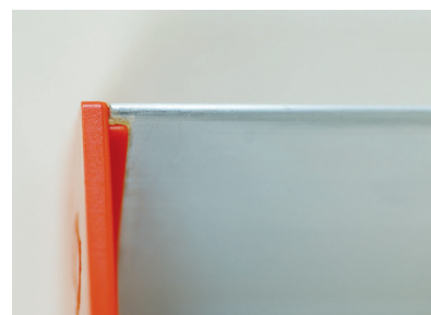
Round edge for build up

Pro M Coaters are available in standard sizes from 2 inches to 144 inches (2 inch increments), but custom lengths are available. Contact your Sefar Sales Representative for more information.