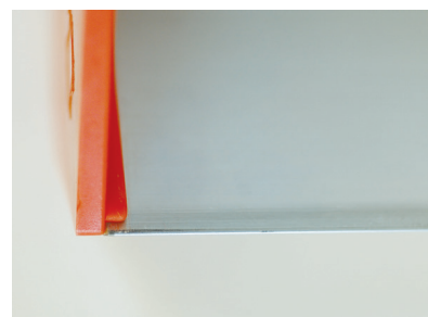
Sharp edge for face coats